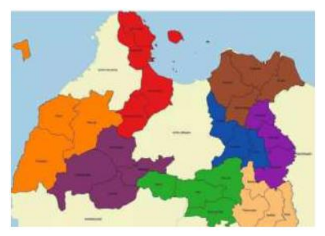
Figure 1. Geographical Map of Serang Regency

The strategic geographical location of Sukaratu Village and beautiful natural conditions allow tourism to develop rapidly. Sukaratu Village has an area of 4.23 km2 consisting of 5 hamlets, 5 community units, and 11 neighborhood units. because it is classified as a village that has a high number of poor people, 34% of the total 2273 households. The total population of this village reaches 6536 people, with a relatively equal number of male and female residents. The land potential in this village is actually quite good, namely 94 ha of rice fields with very good irrigation because there is a water source, 178 ha of dry land, 66.11 ha of public facilities out of a total area of 4.23 km2.