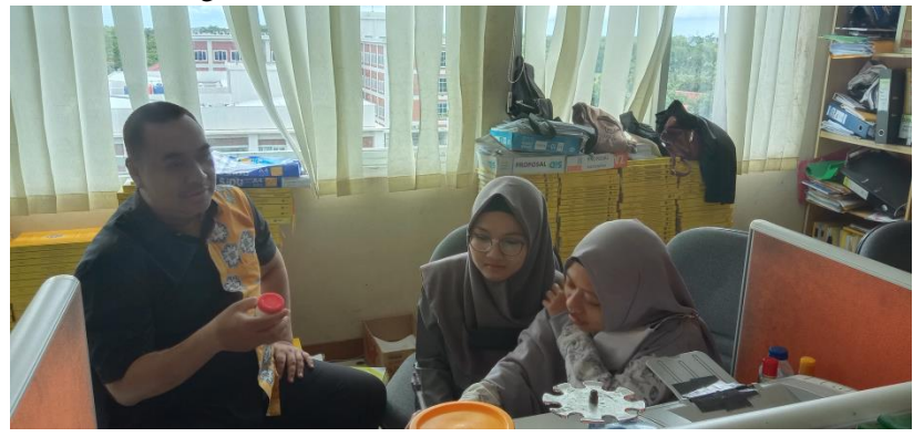
Figure 6. Evaluation of Service Activity Results

Evaluation of this activity is carried out by providing critique sheets and suggestions to the training participants at the end of the event. The aspects that are reviewed are everything from registration to practice. Based on the results of the critique sheet and suggestions, it shows that they are very happy with this event. According to them, the training they received was new and useful. In addition, they are motivated and enthusiastic to receive similar trainings and hope that this collaboration will continue to be held every year. In addition, they also gave criticism that this event was too short and the materials used were not enough