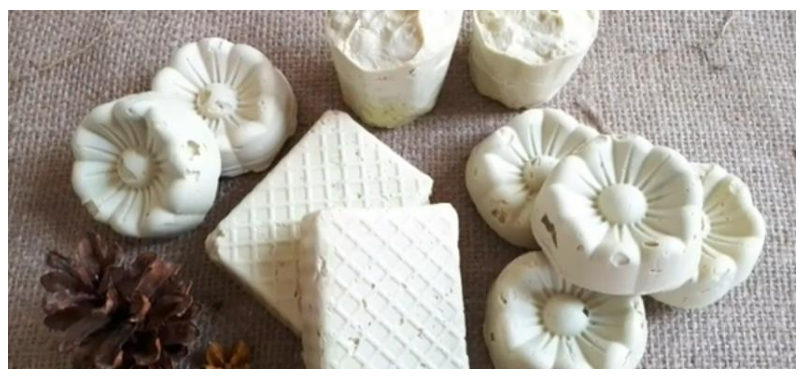
Figure 5. Soap that is ready, packaged, marketed and used

Evaluation of this activity is carried out by providing critique sheets and suggestions to the training participants at the end of the event. The aspects that are reviewed are everything from registration to practice. Based on the results of the critique sheet and suggestions, it shows that they are very happy with this event. According to them, the training they received was new and useful. In addition, they are motivated and enthusiastic to receive similar trainings and hope that this collaboration will continue to be held every year. In addition, they also gave criticism that this event was too short and the materials used were not enough