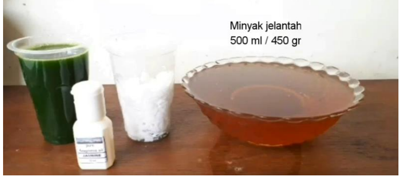
Figure 3. Raw Materials for Making Soap

The core activity of community service in the form of training on making dish soap from used cooking oil was carried out on November 20, 2021 at the house of Mrs. Betty, the Chairperson of RT 03 RW 01 Sukaratu. The activity was attended by 46 members of the PKK RT 03 RW 01 Sukaratu community. The training includes explanations, video playback, and simple practice. Residents were very enthusiastic about listening to the explanations of the service team as seen from the questions asked during the training. The community is enthusiastic about participating in service activities because the material presented can increase knowledge and skills and provide entrepreneurial insight. The product from community service in the form of dish soap from used cooking oil was also exhibited in the village competition as an innovative product of RW 01 Sukaratu. The implementation of this community service activity is presented in Figures 3, 4, 5 and 6