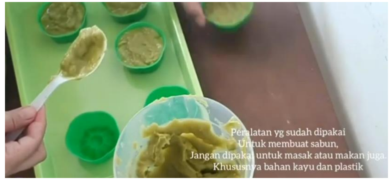
Figure 4. Soap Making Printing